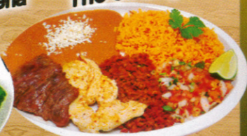
The 3 Amigos